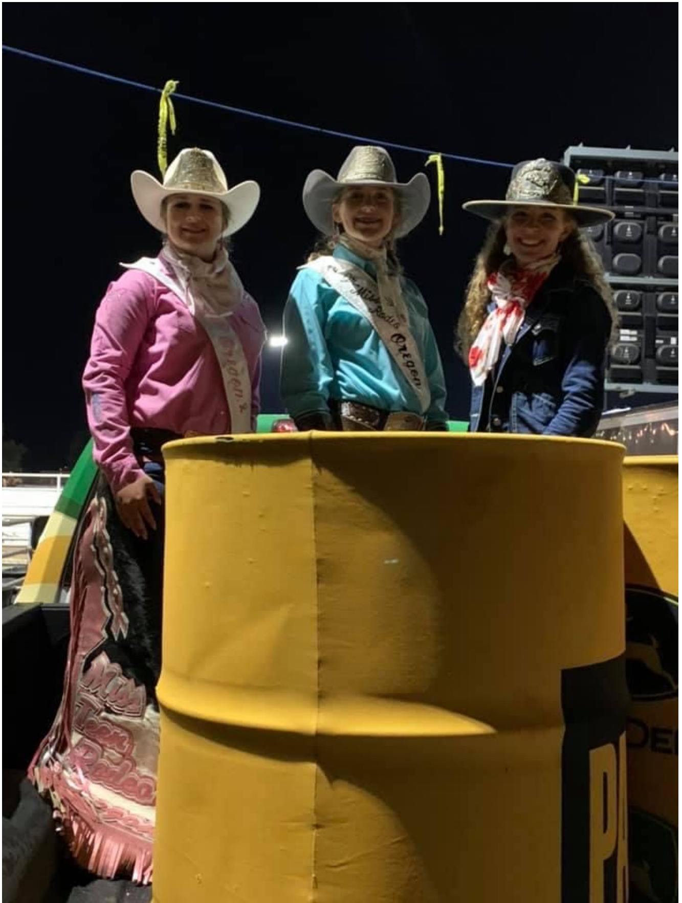
Riding in the barrel truck