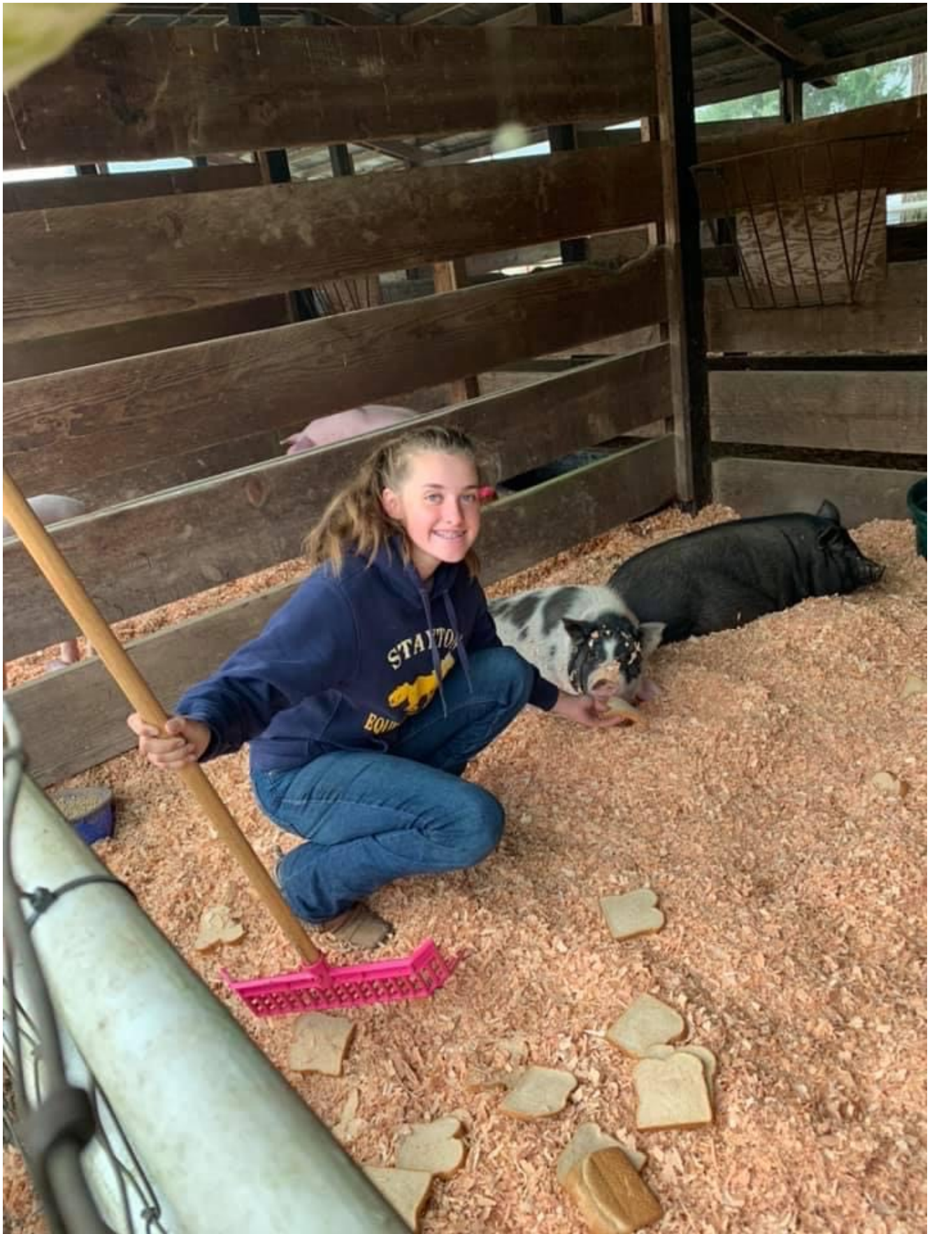
Just a couple of the evacuated animals