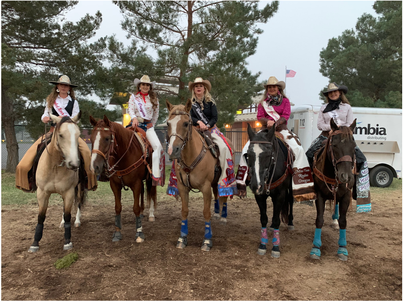
Crooked River Roundup Queen, MRO, MRW, MTR and JMR