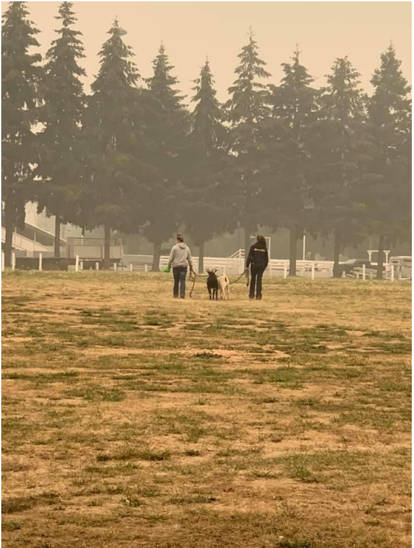
Walking the evacuated goats