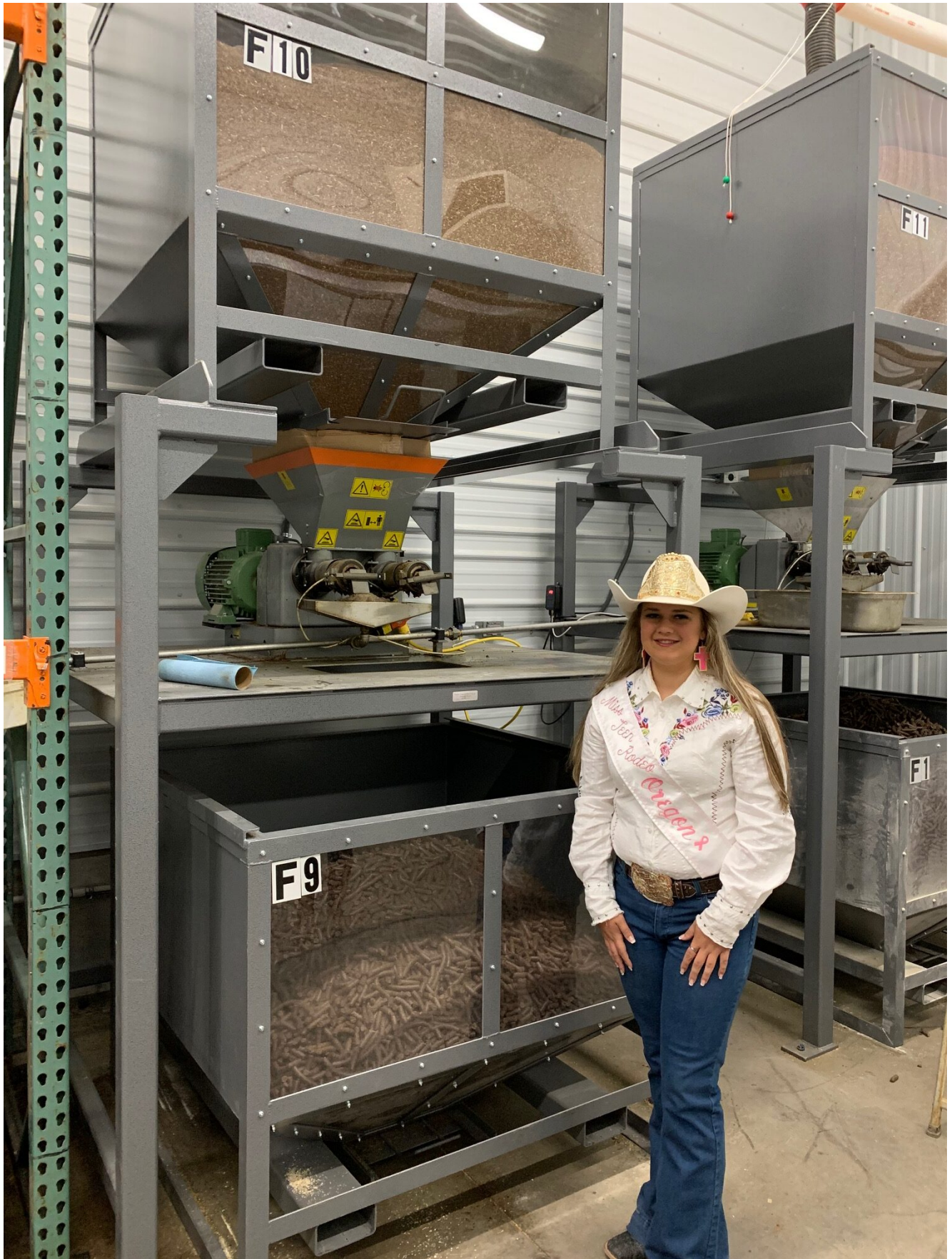
At Horse Guard—how they make their Flix Treats