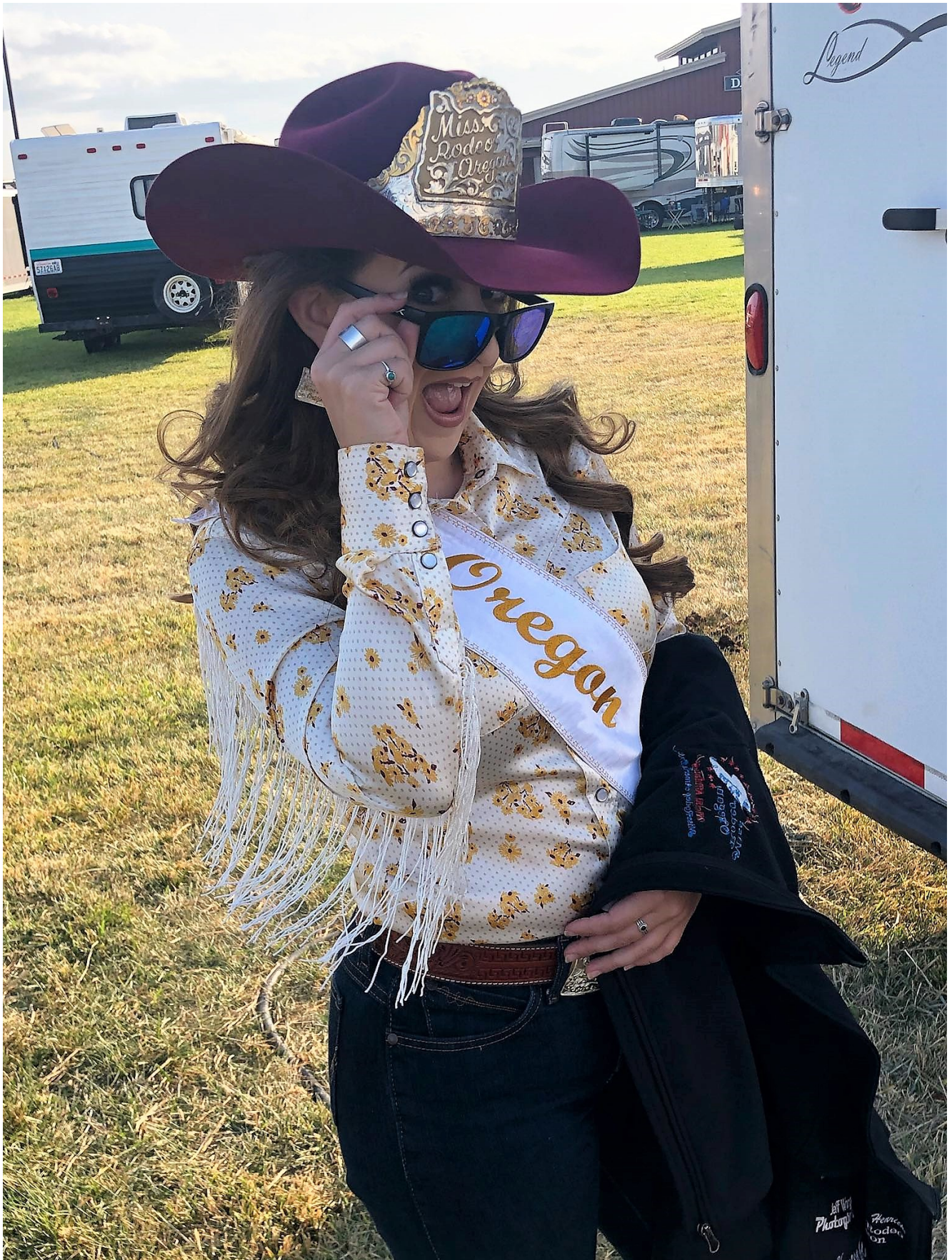
BEX sunglasses, an MRA sponsor who provided sunglasses to all state queens