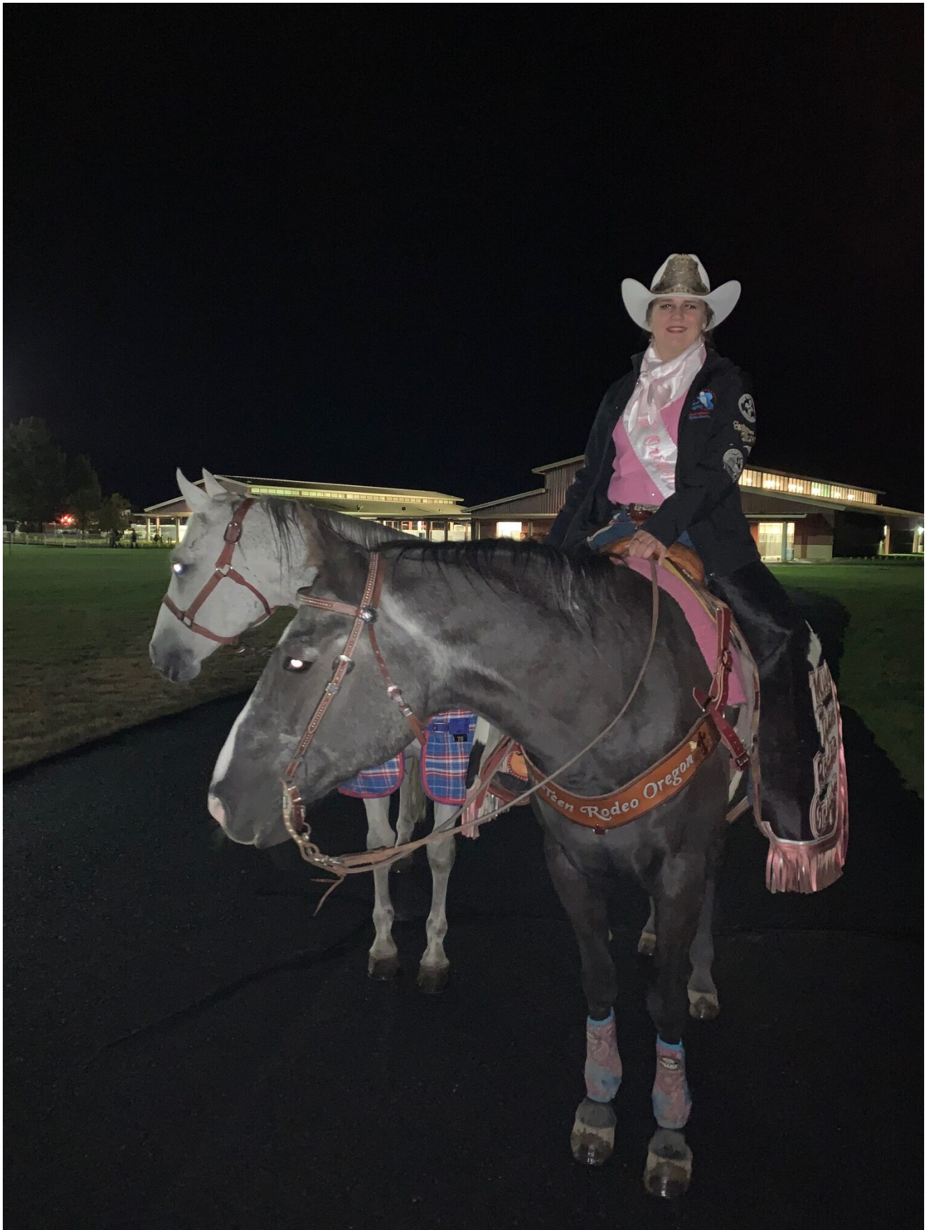
Putting Pete and Hoot away after night two