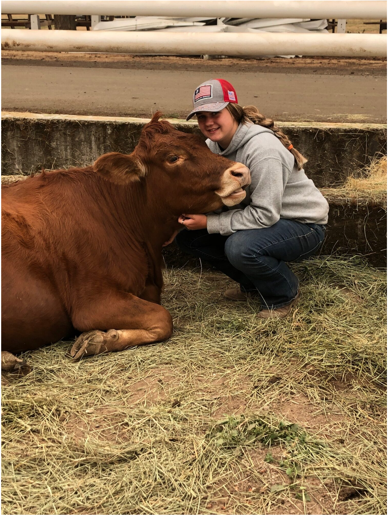
One of my favorite evacuees