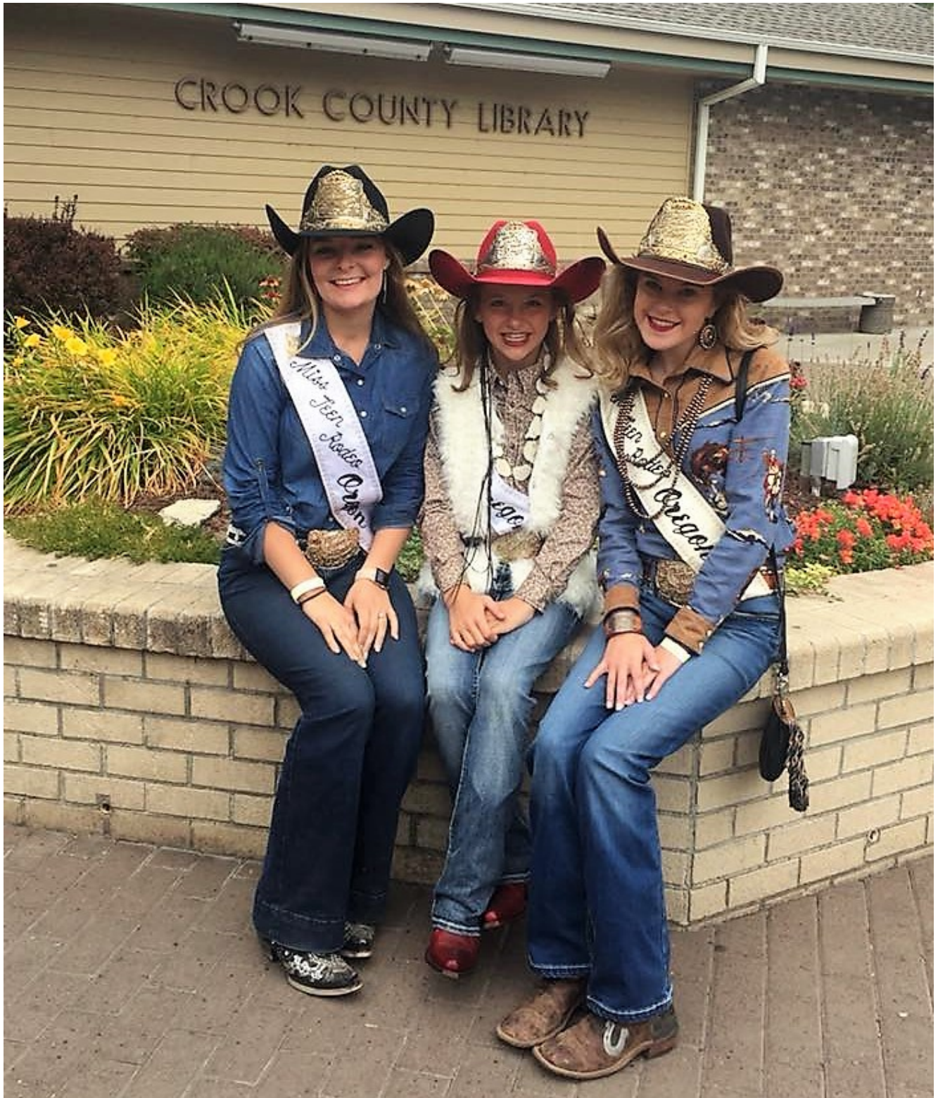
Junior and Teens waiting for our board meeting in Prineville!