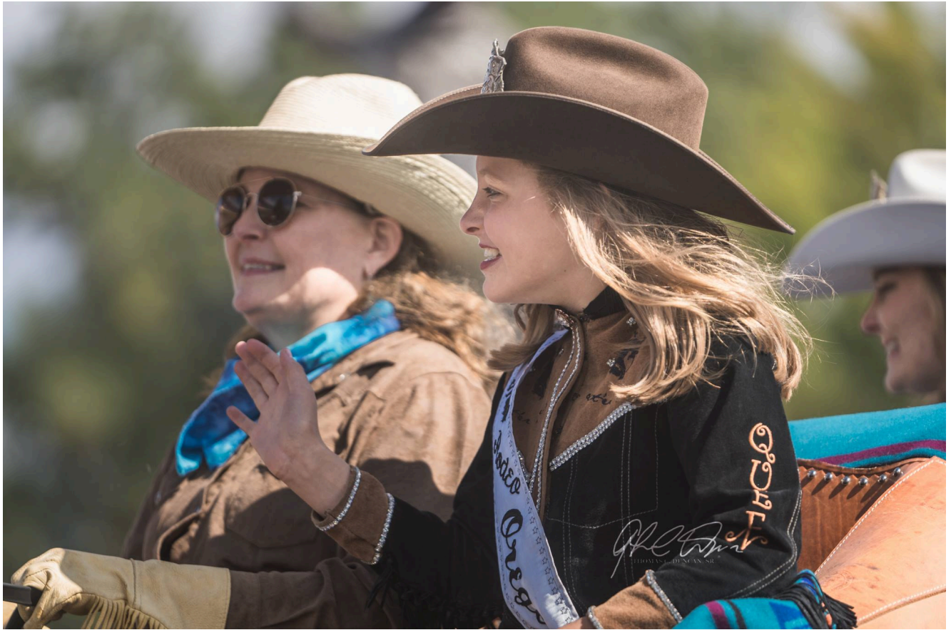
Photo by Thomas C. Duncan Photography at Pendleton's Westward Ho parade!

September was one of my best months of rodeo yet! It has been such an honor to represent the sport of rodeo in our amazing state of Oregon! I plan on focusing on community events for the next three months and giving back to the community.