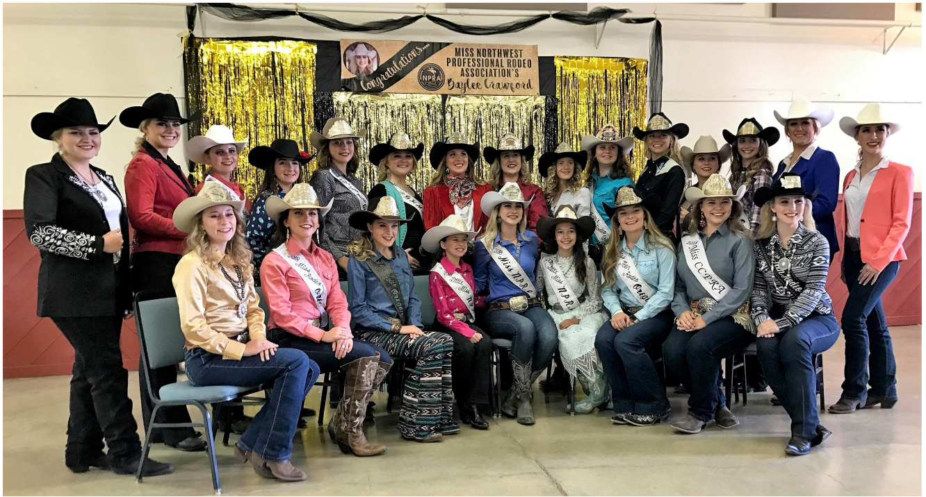
At the Northwest Pro Rodeo Association Pageant.