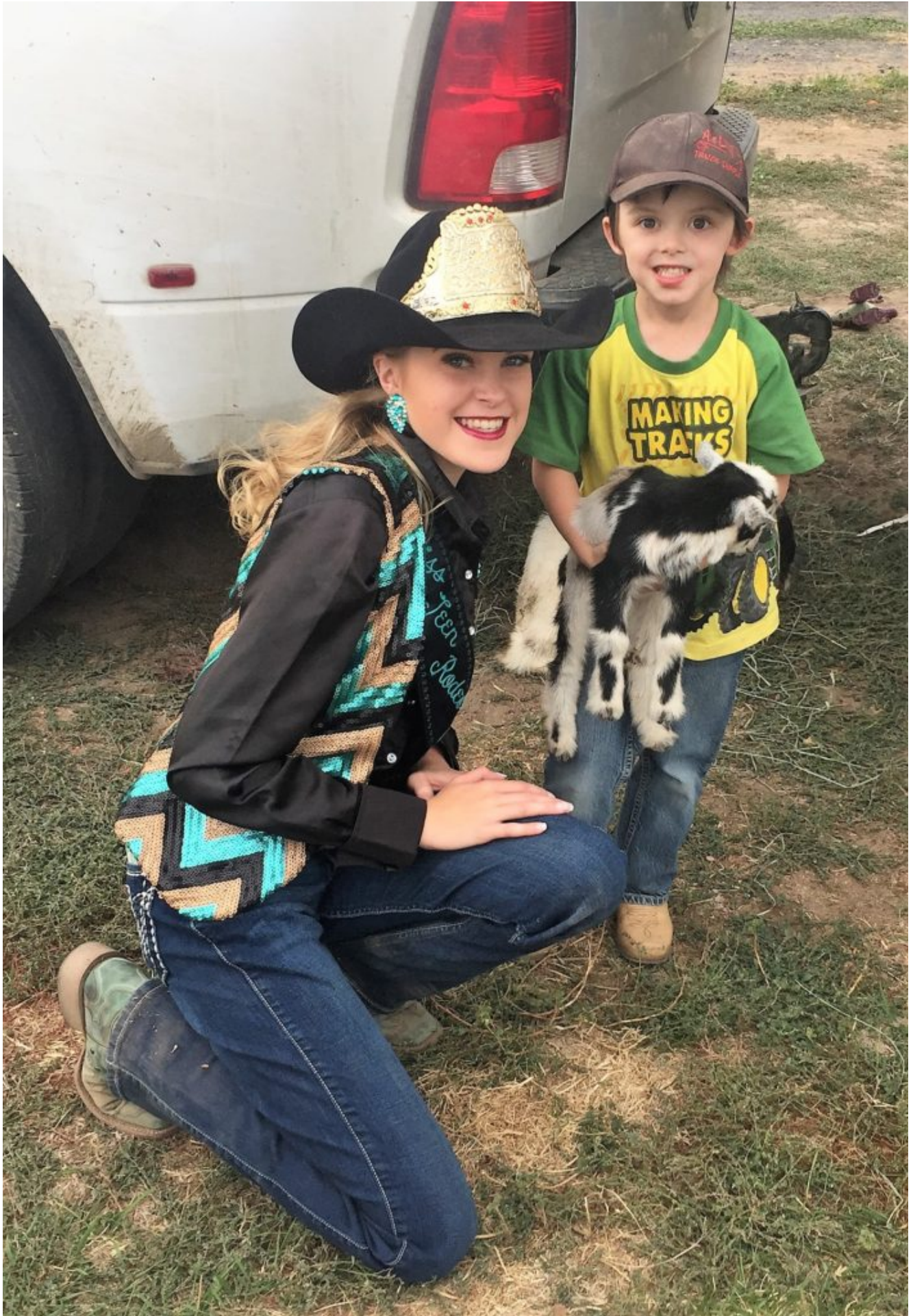
I'm at the NPRA finals with a baby goat named "Goat"!