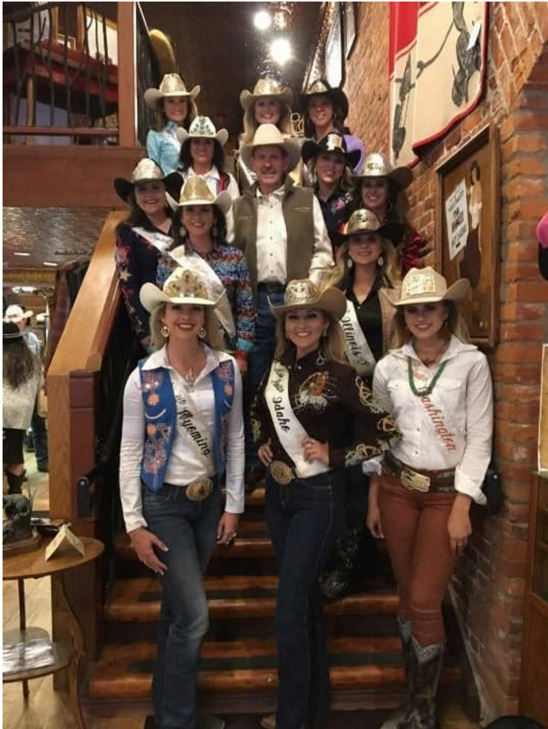
At Hamley's Western Store with all twelve state queens.