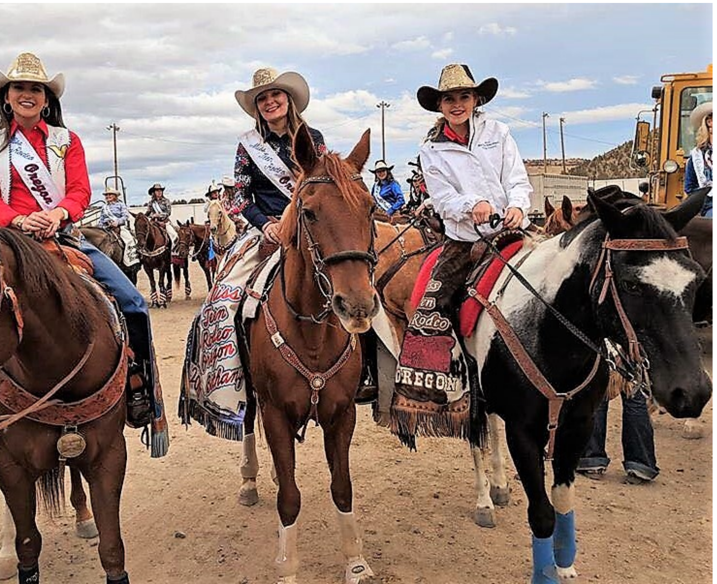
y, and me in Prineville.