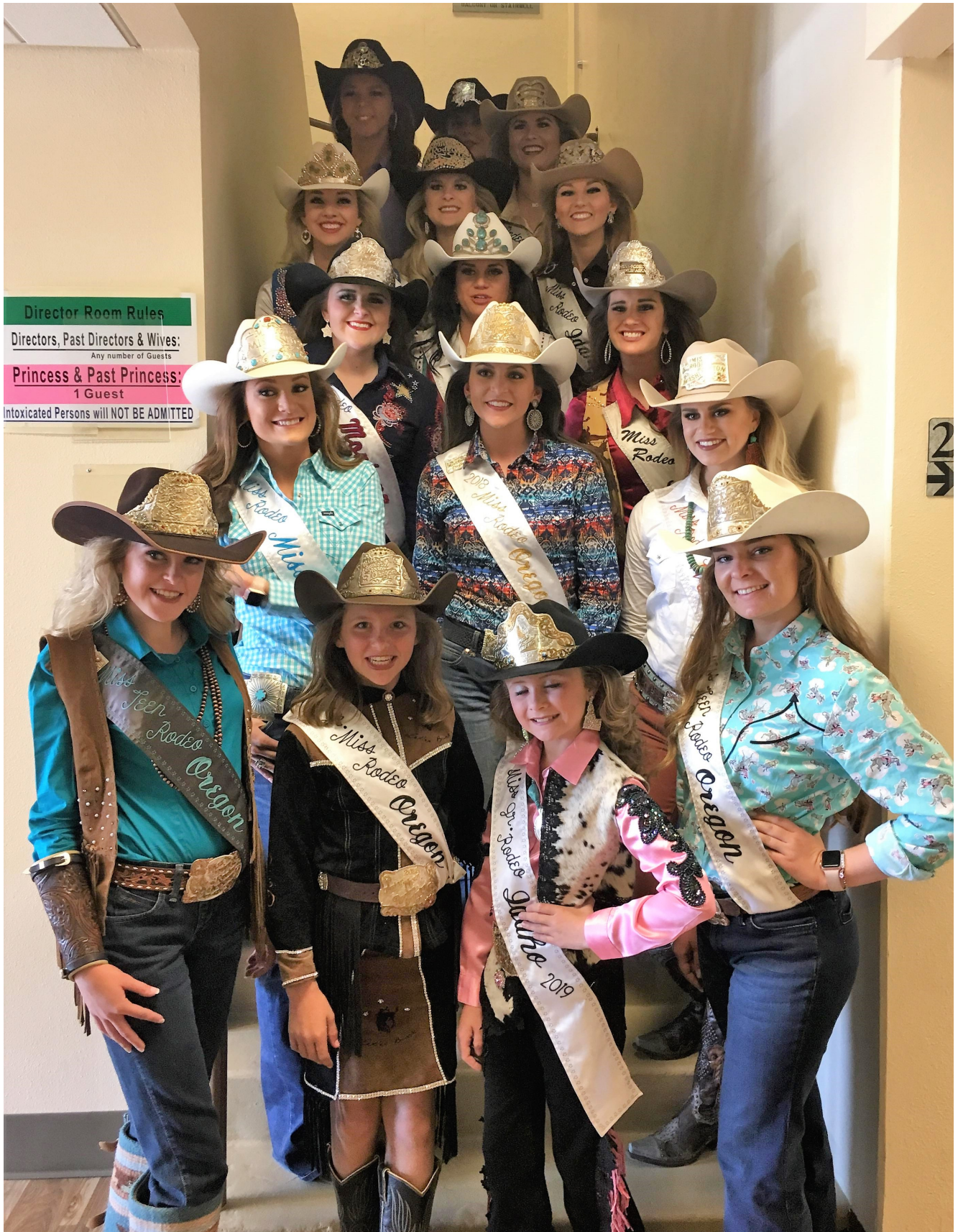
Here we are with all of the state titleholders visiting the Pendleton Round-Up!