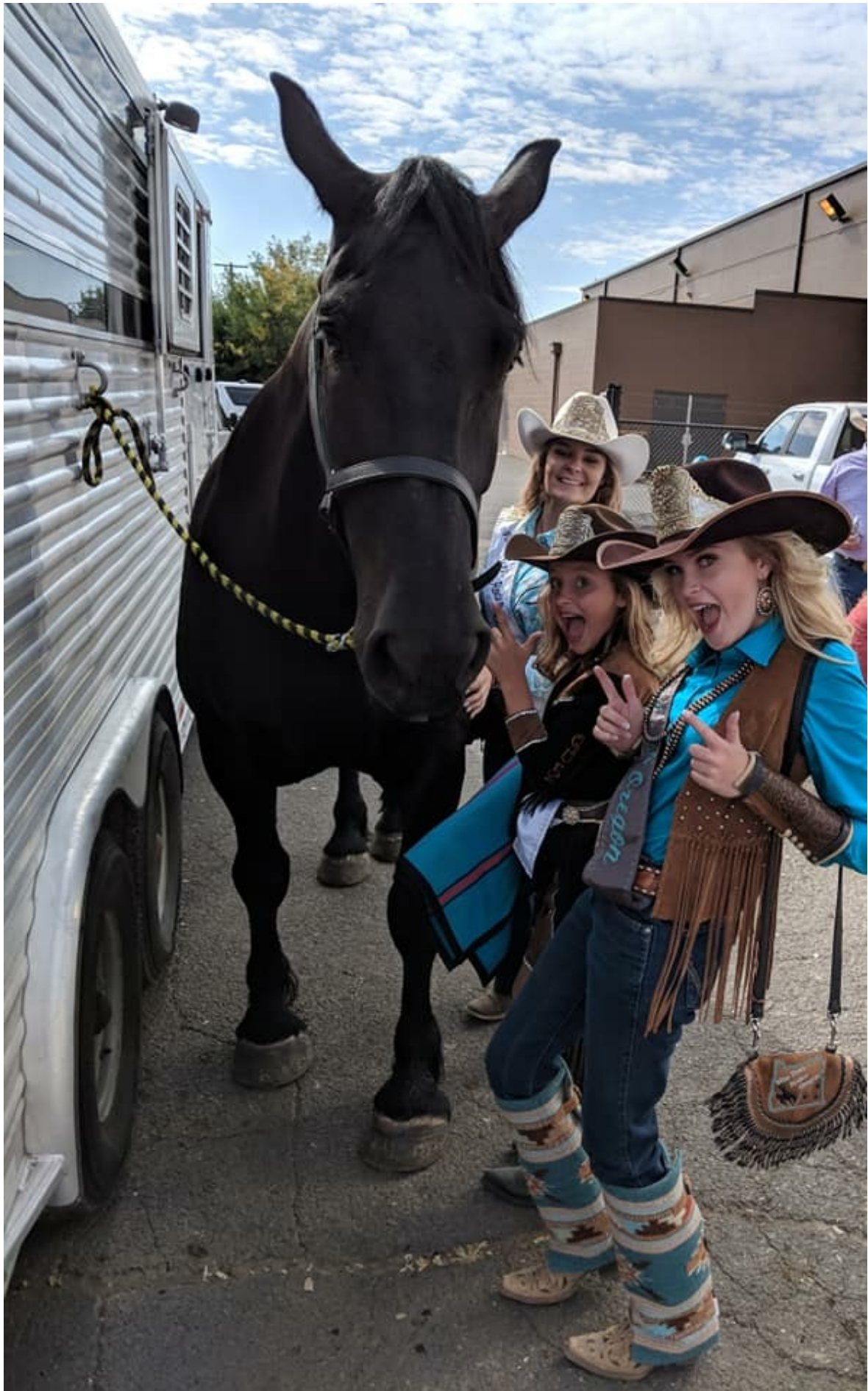
At the Westward Ho Parade.