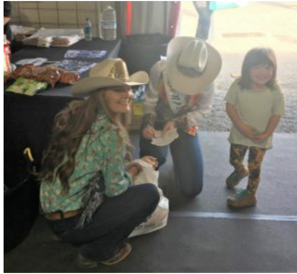
Signing autographs at a booth in Pendleton!