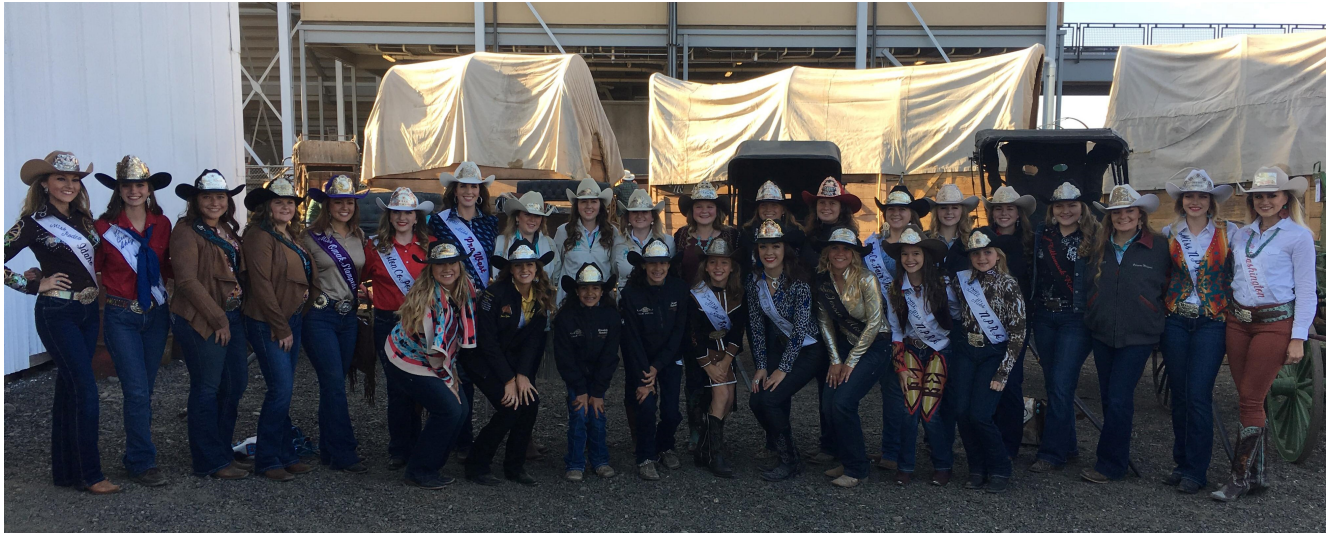
Everybody waiting for the Westward Ho Parade in Pendleton!