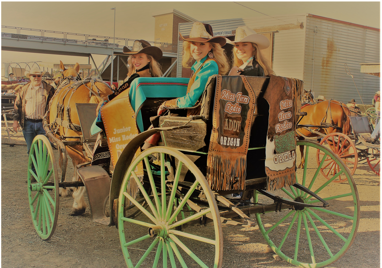
Teens and me at the Westward Ho parade.