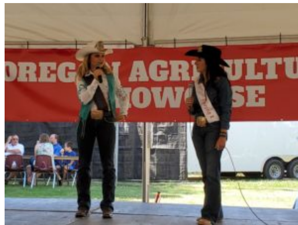
Guest speakers at the Oregon State Fair, talking about the year so far!