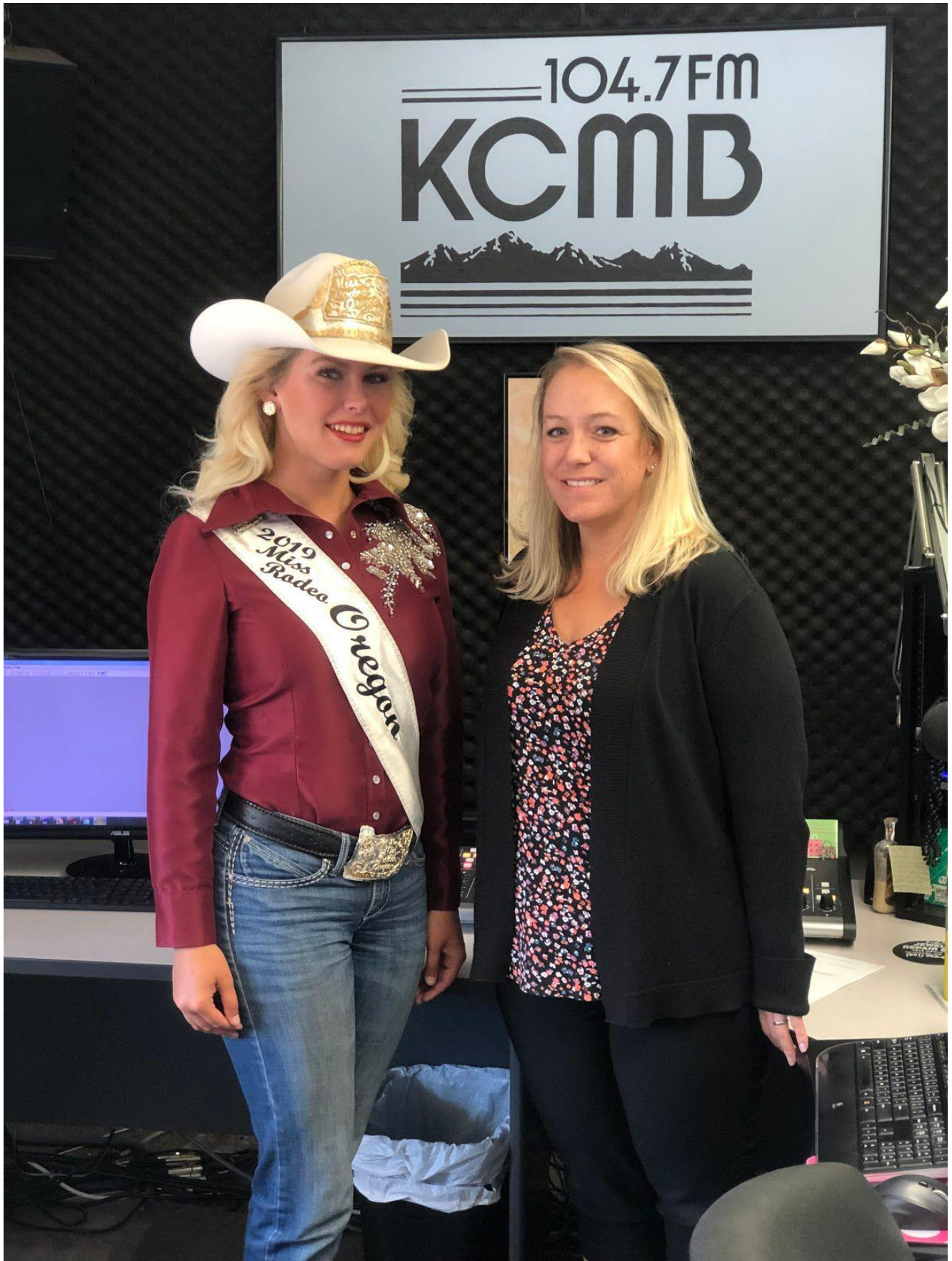
Recording my EOU radio ad in La Grande, Oregon