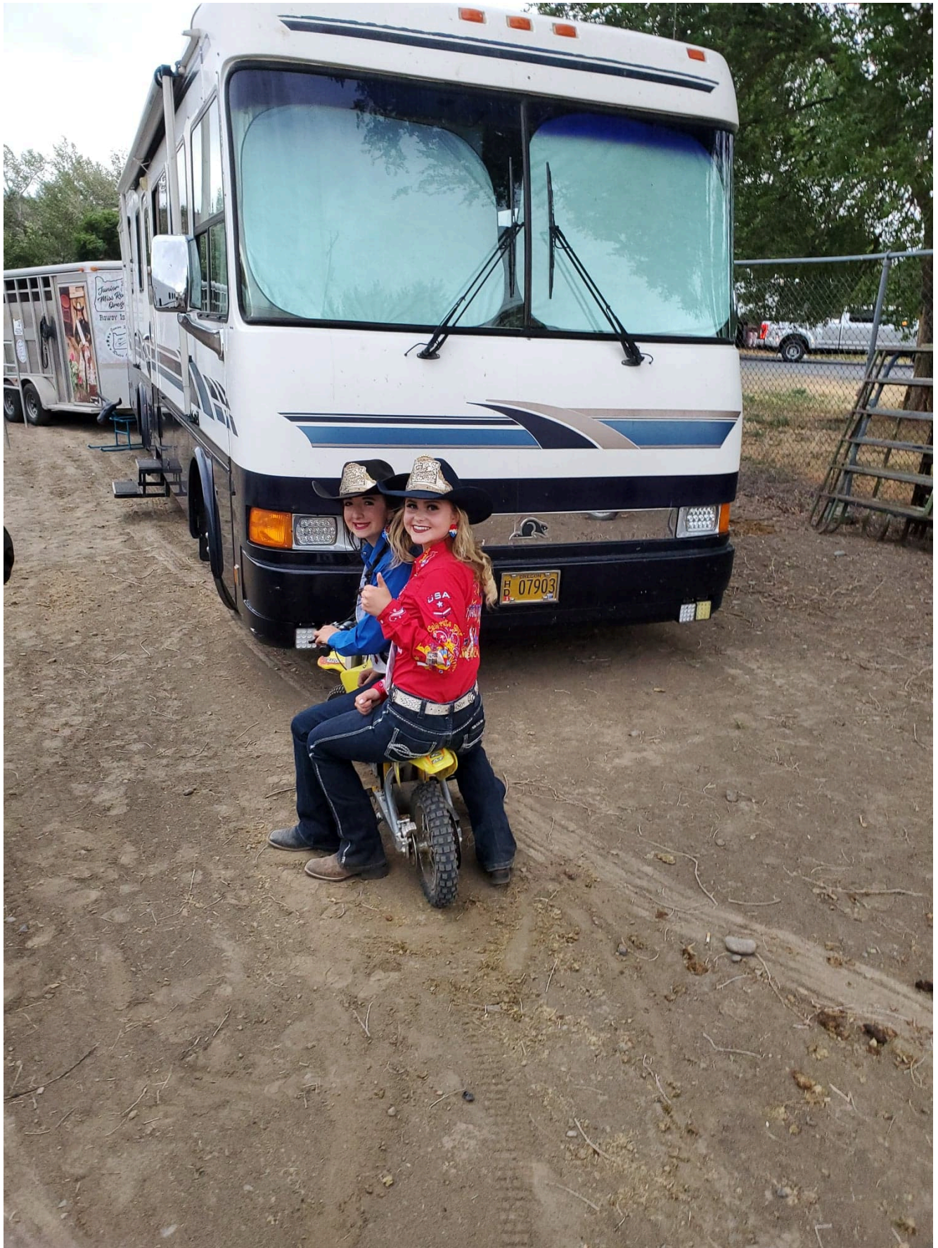
Girls riding the steel horse!