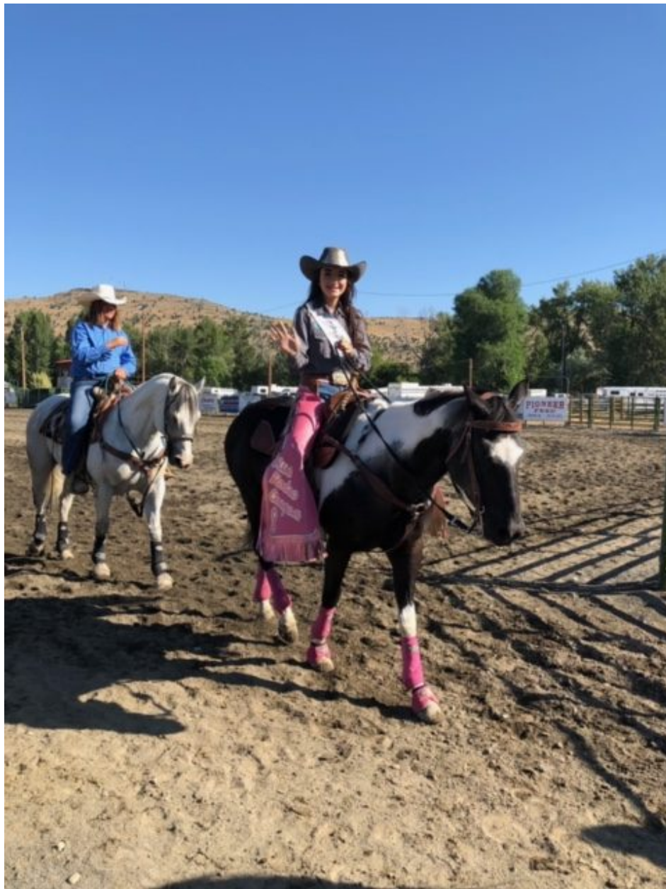
Cinnabar Mountain Playday Kids Rodeo Grand Entry

state representatives for Miss Rodeo Oregon, Inc. Enjoying the fair activities was fun as I had never been to the Oregon State Fair before. We signed some autographs and had some fun before we headed back home, so that I could start school on that Monday August 26th. School, volleyball and rodeo are on the event list for September!