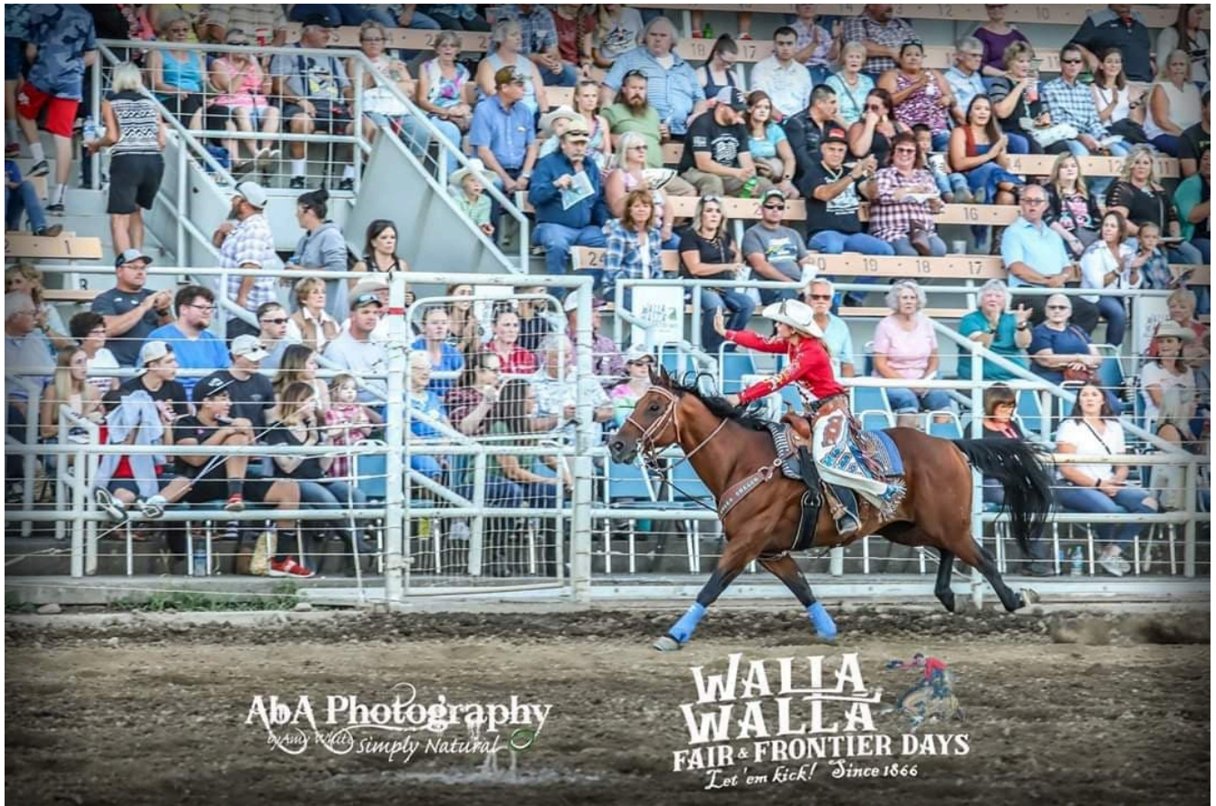
Walla Walla Fair & Frontier Days