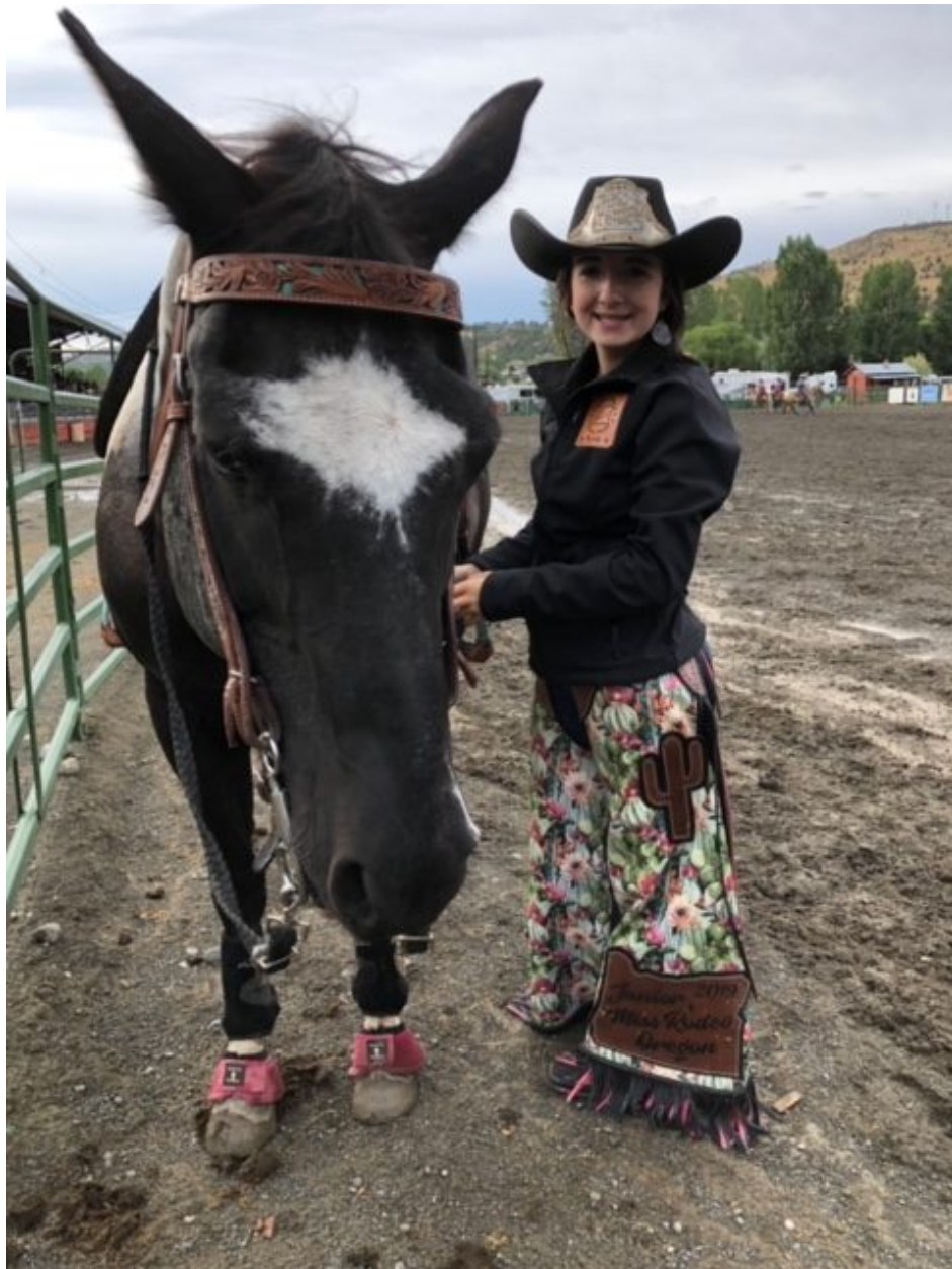
Saturday at Grant County NPRA Rodeo was a bit muddy!