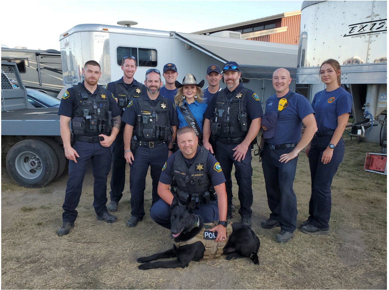
First Responders Night at the Deschutes Rodeo.