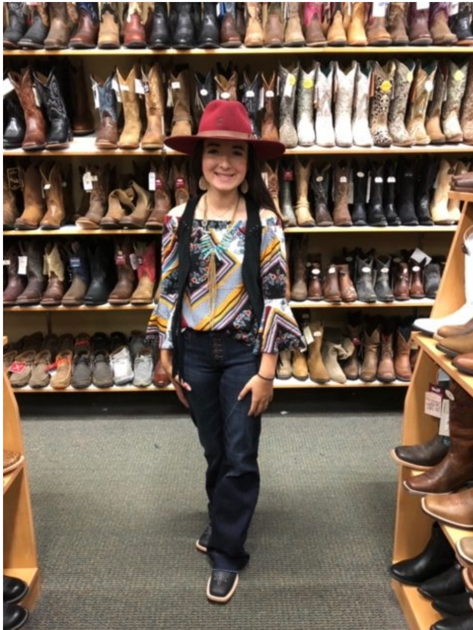
Boot Barn western trend outfit for the fashion show