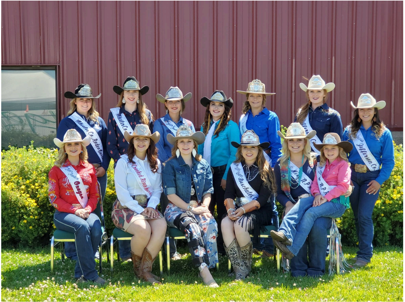
Deschutes County Fair and Rodeo Queen Luncheon