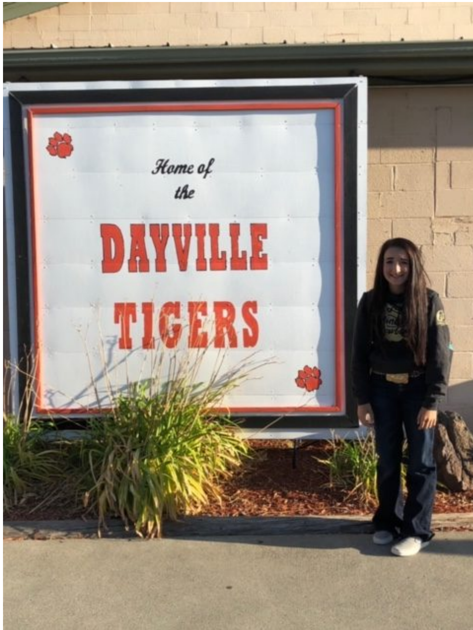
First day back to school!