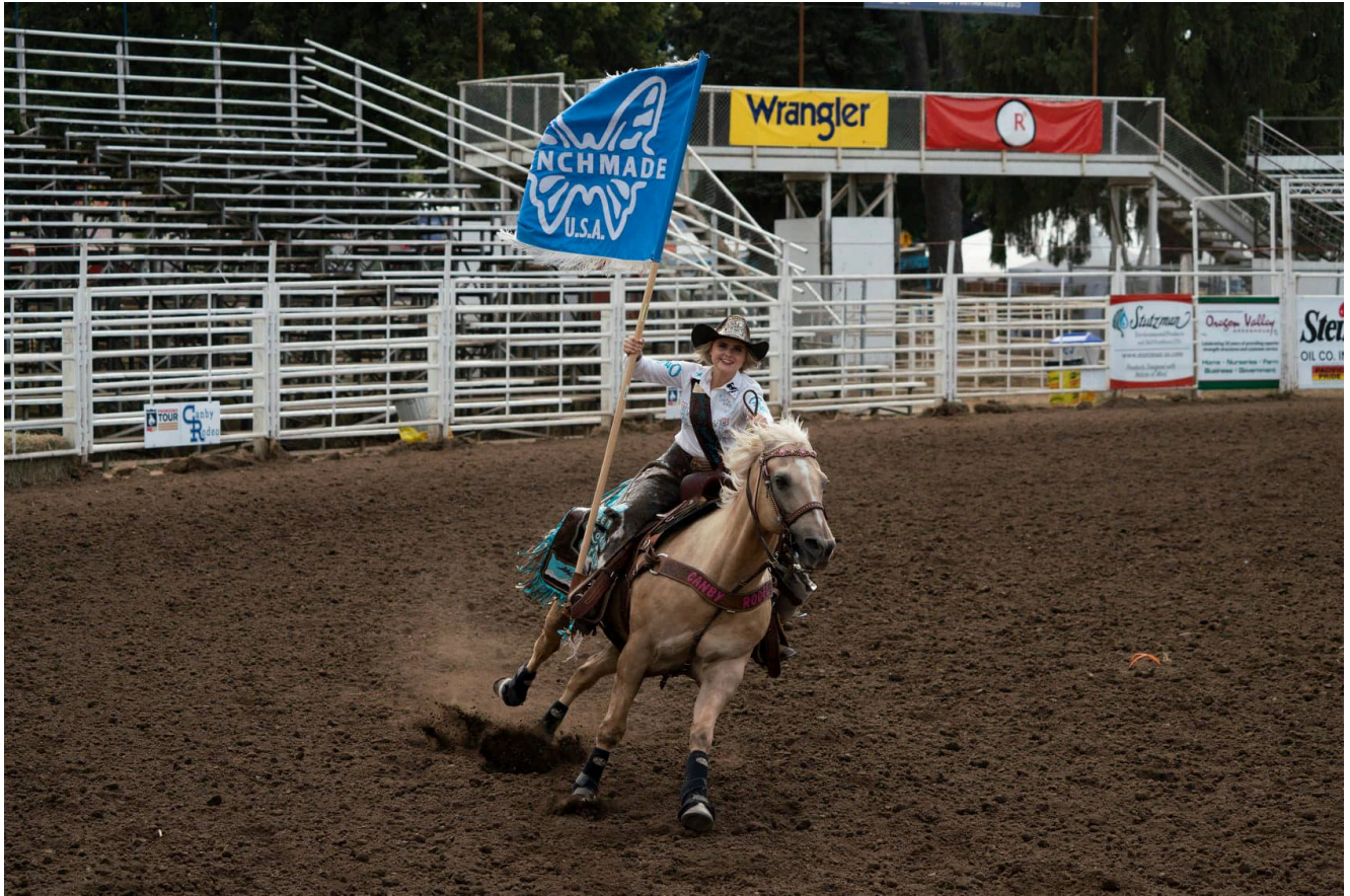
At Horsemanship-MR0 Pageant