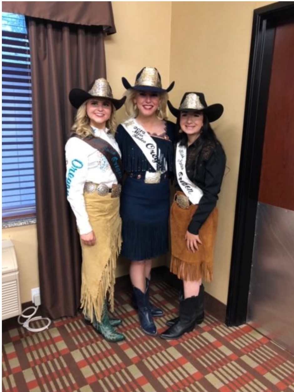
The three of us at Orientation