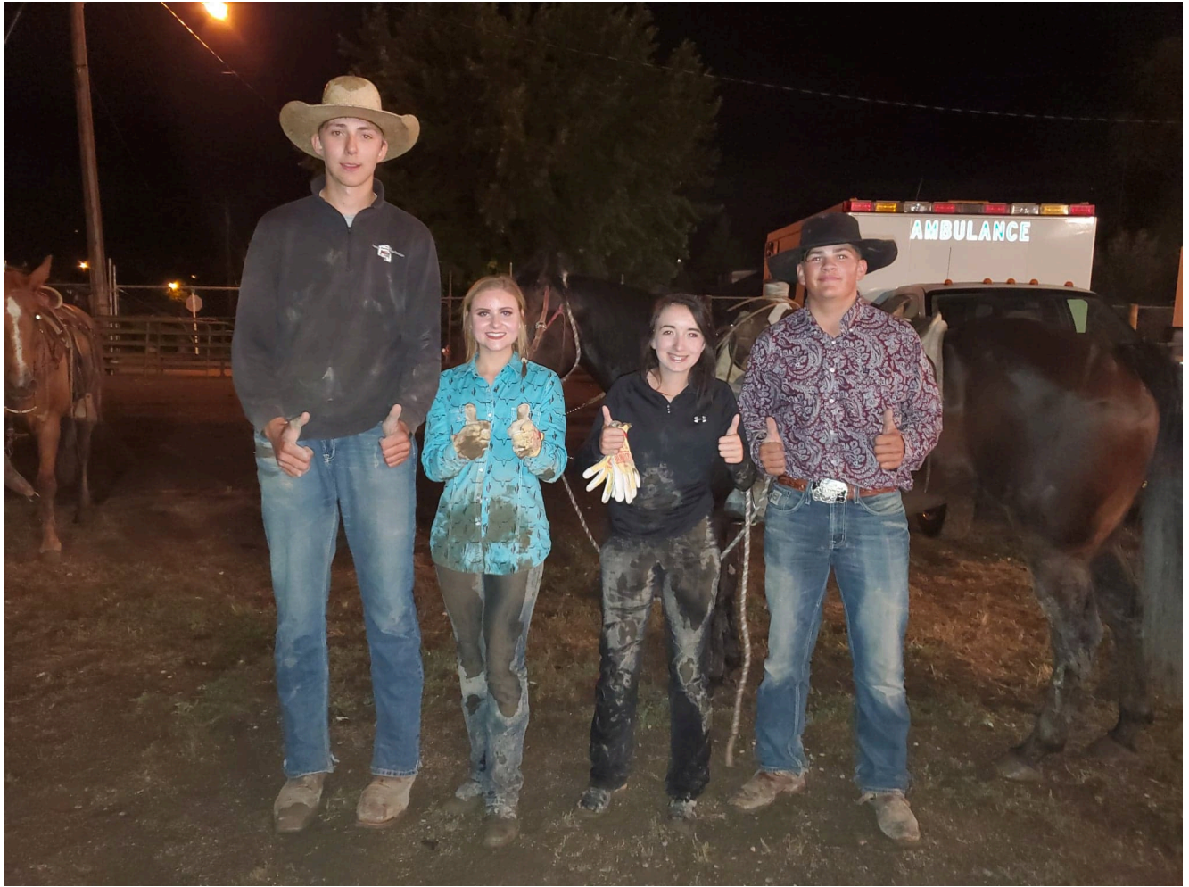
Muddy from the cowhide race at the Grant County Fair and Rodeo!