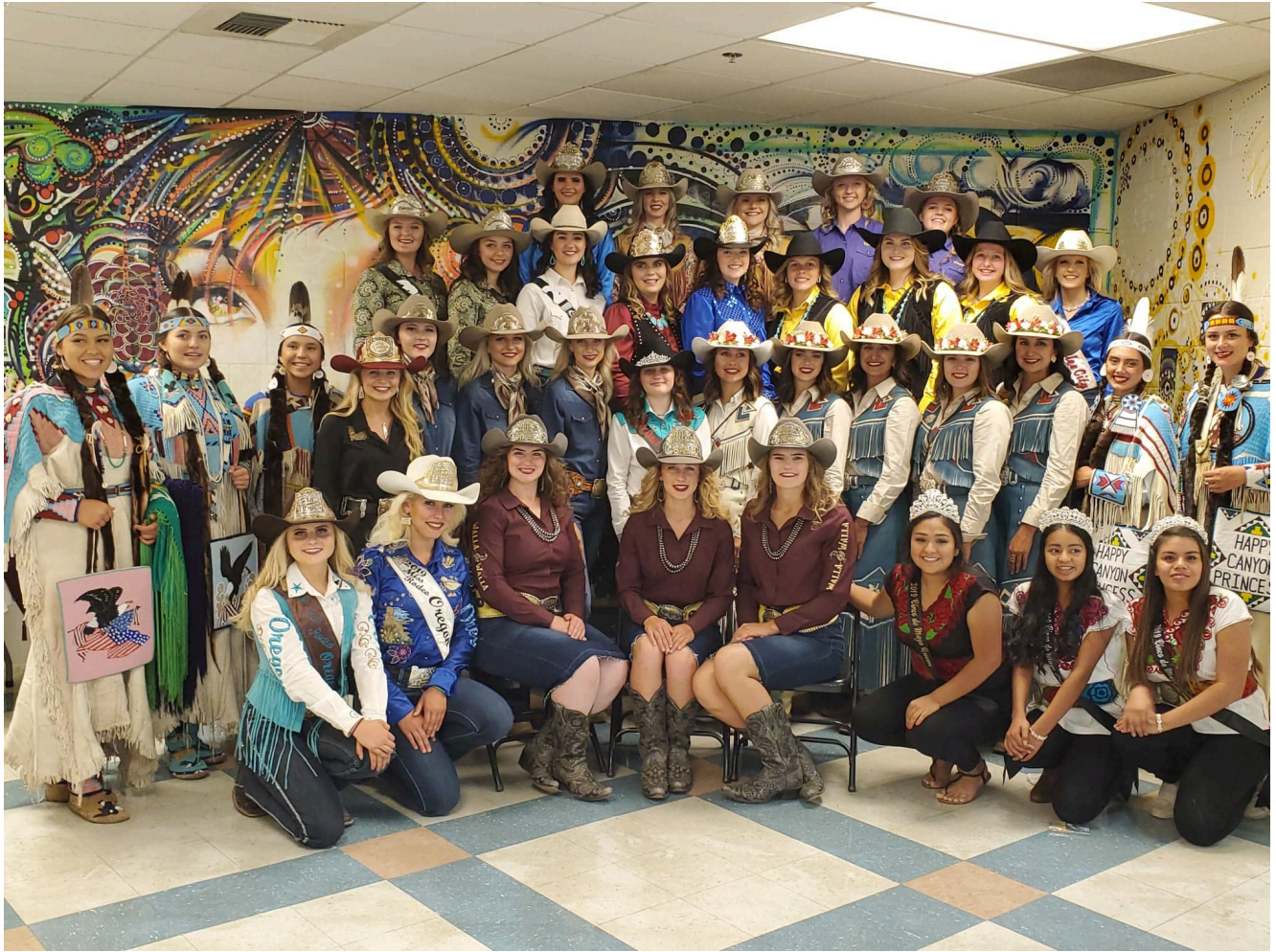
Queen Luncheon at Walla Walla Fair & Frontier Days