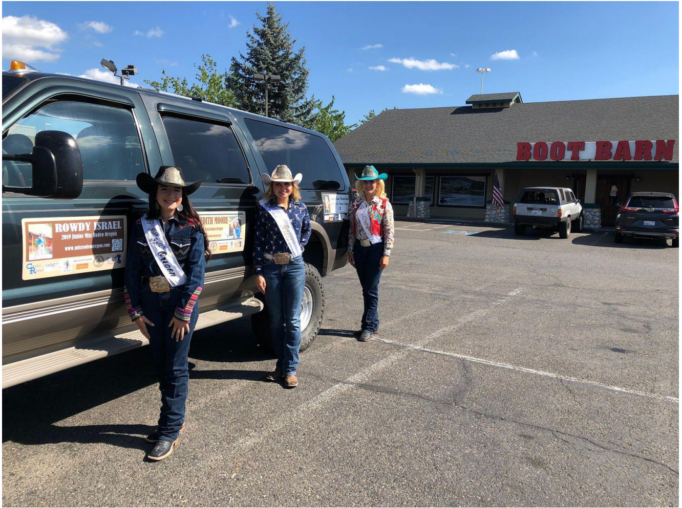
Visiting our sponsor Boon Barn of Troutdale in style!