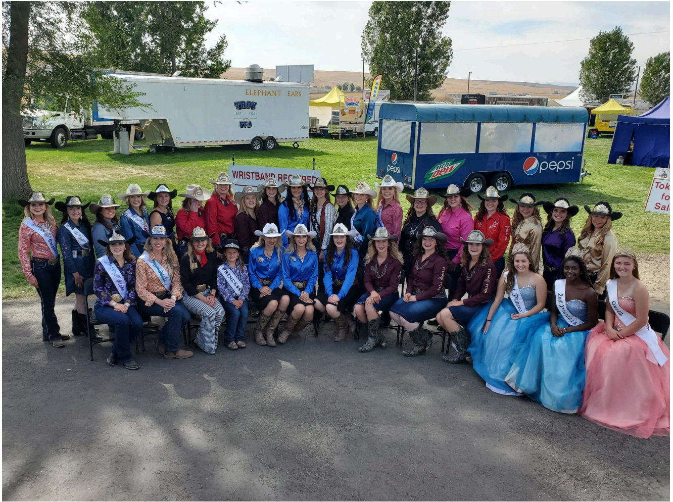
Lewiston Roundup Queen Luncheon