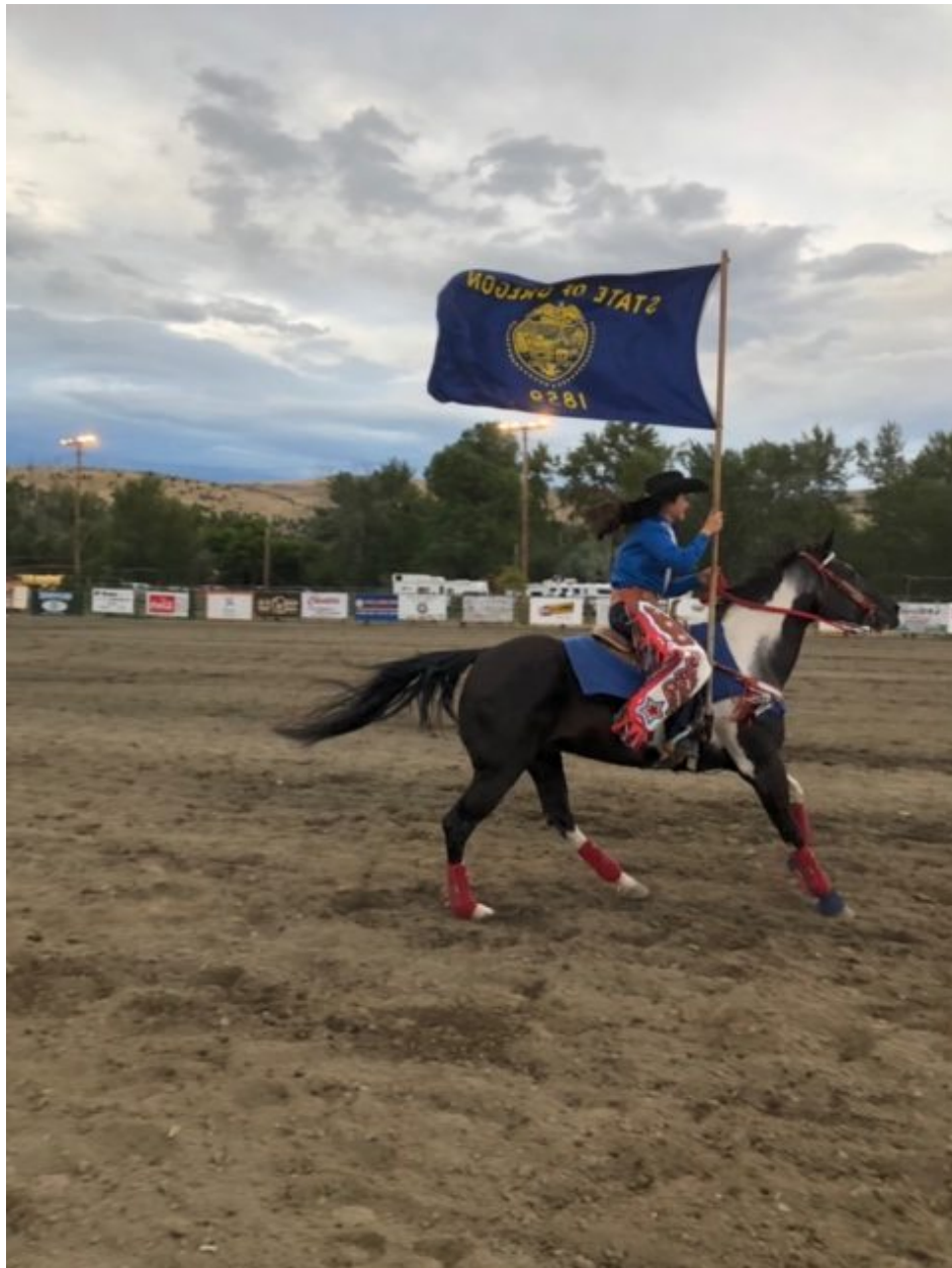
Honored to be able to carry the Oregon flag at the Grant County NPRA Rodeo Friday night perf