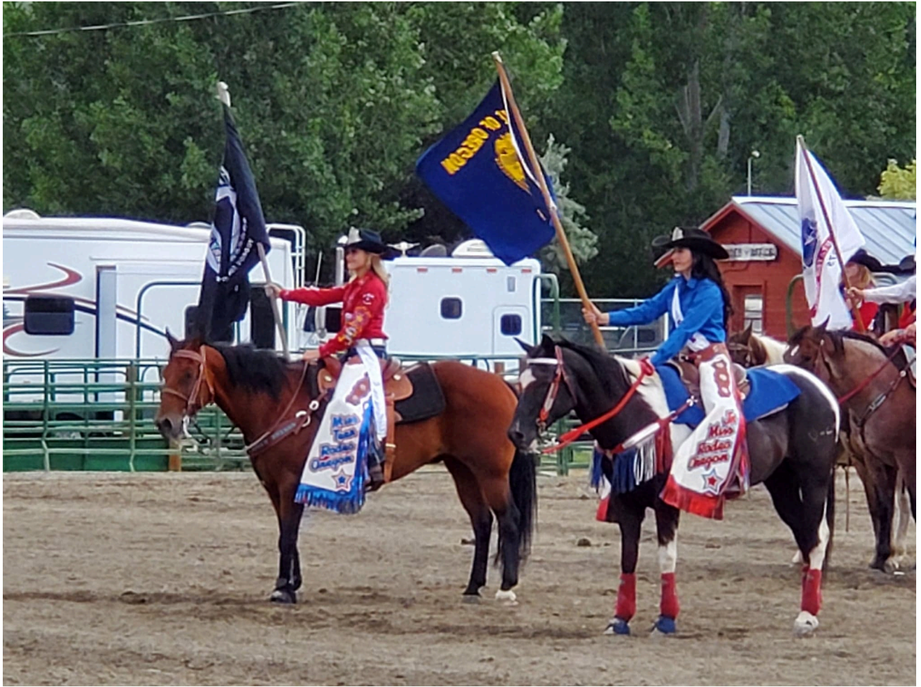
Veteran's Night at the Grant Co. Fair and Rodeo, carrying the POW flag.