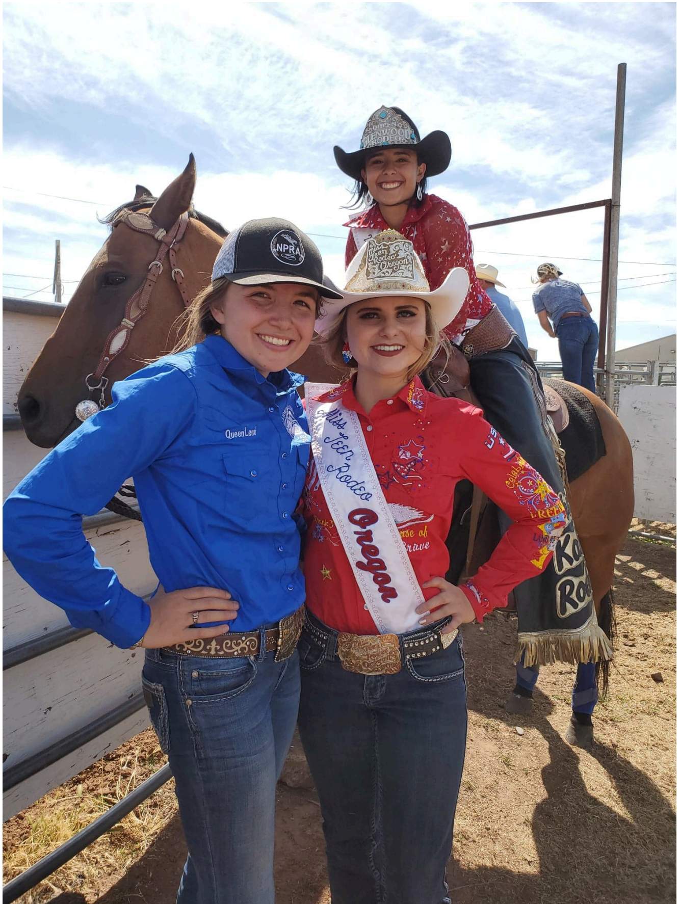
Quick stop in Goldendale for the Klickitat County Fair & Rodeo