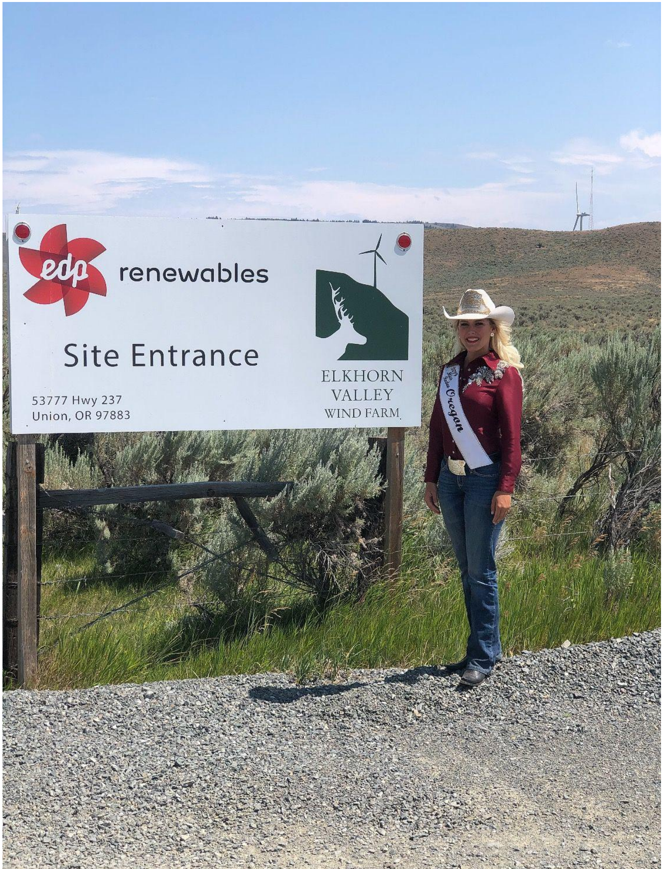
Visiting EDP Renewables in Union, Oregon