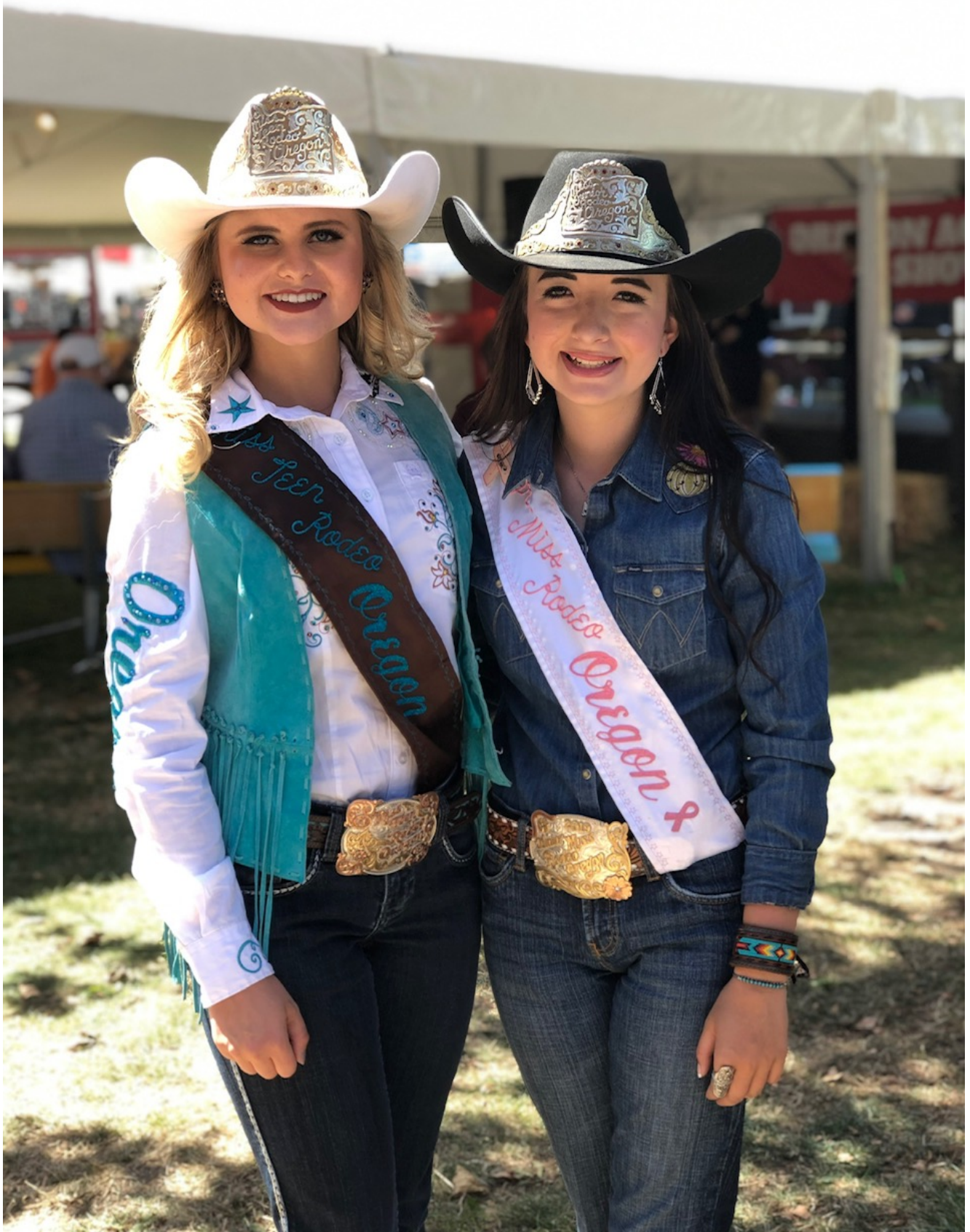
State Fair at the Agriculture Stage